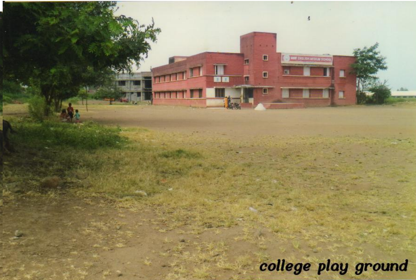
college play ground